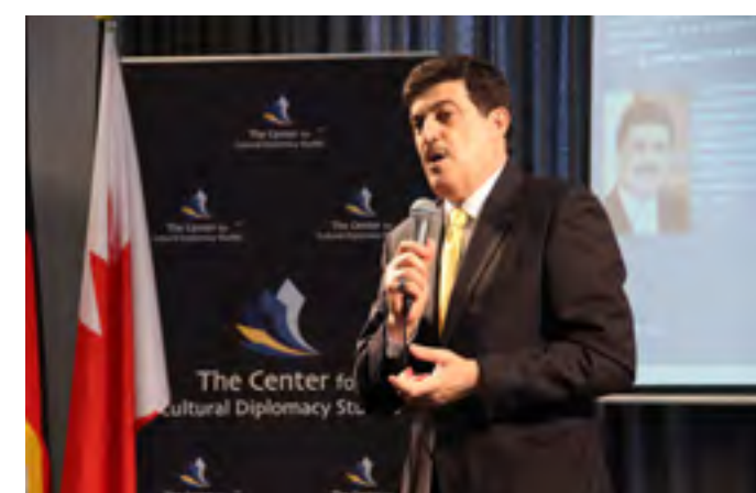
The Hon. Dr. Nazar al Baharna, Secretary General of the ICD Center for Conflict Zones Mediation; Former Foreign Minister of Bahrain

The former Foreign Minister of Bahrain argued the case for a Human Rights agenda, based on existing international Human Rights law, which could serve