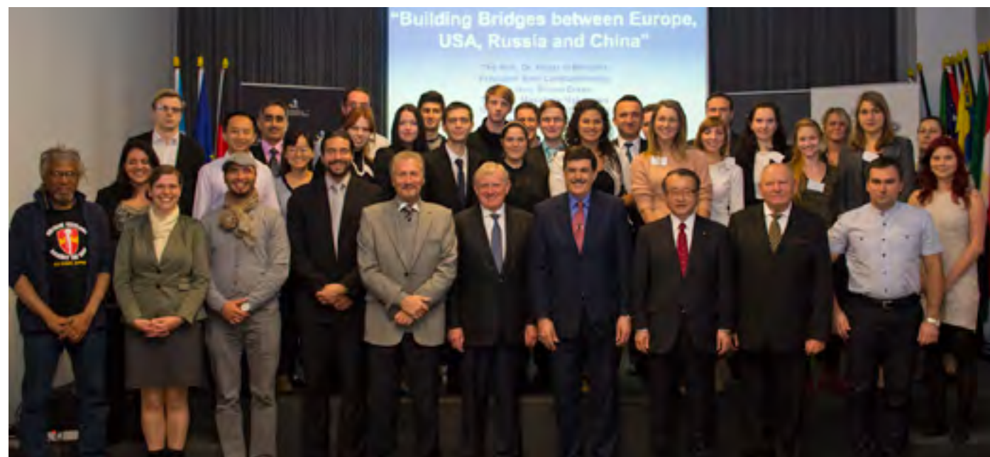
Group Photo on the Second Day of “The Berlin Inaugural Event of the Cross Continental Cooperation Summit”