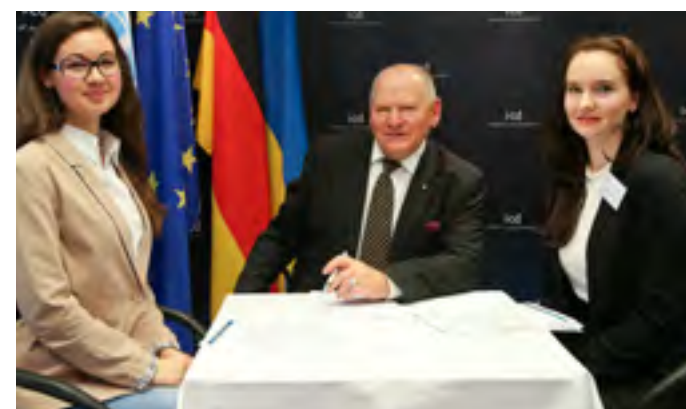
An Interview with Dr. Mykola Zhulynsky Former Deputy Prime Minister of Ukraine