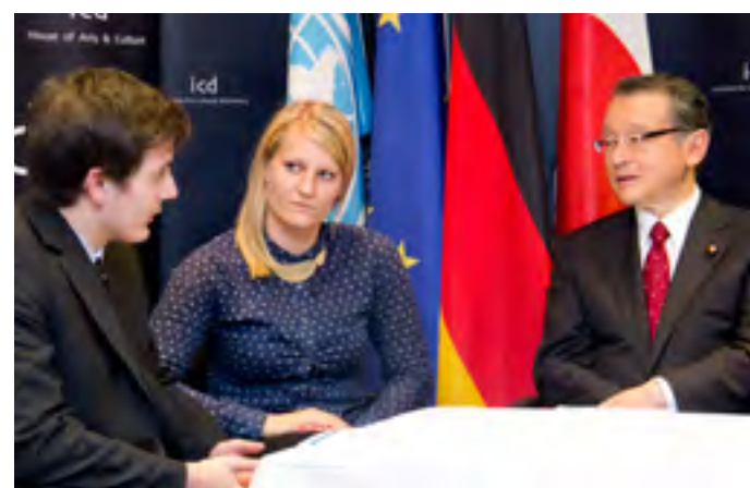
An Interview with The Hon. Masaharu Nakagawa Former Minister of Education & Culture of Japan

When asked directly about the role Cultural Diplomacy could play in these ambitious plans Mr. Nakagawa asserted that such involvement was crucial. However there was one caveat spoken of by Mr. Nakagawa and this was that the government should remain largely un-involved in the process and that the cultural diplomacy needs to start happening at a grass roots level, without the government putting words into people’s mouths.