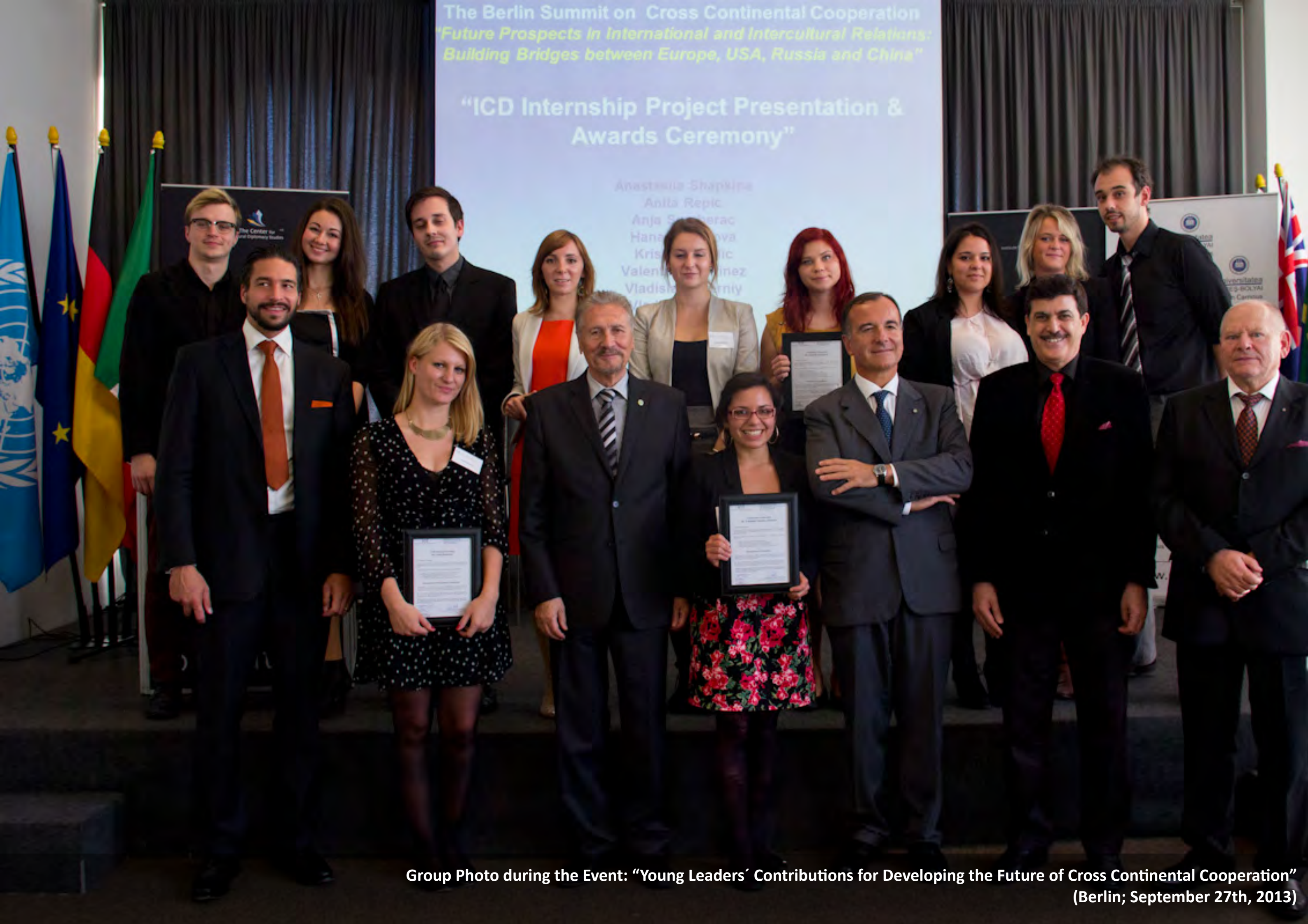
Group Photo during the Event: "Young Leaders' Contributions for Developing the Future of Cross Continental Cooperation" (Berlin; September 27th, 2013)