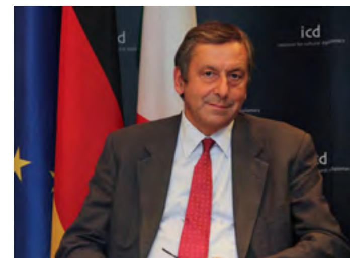
An Interview with the Hon. Dr. Francesco Profumo Former Minister of Education of Italy

The former Minister for Education argued that the 2020 program would benefit the general educational standard of the EU and better equip the future workforce with the skills needed to suit a strong and dynamic economy. However, continued Dr. Profumo, the benefits would run deeper than just stronger economic performance; by intermingling youth from all around Europe, future generations all over the region would have strong intercultural bonds with one another, capable of cooperating in entirely new and effective ways previously unseen in Europe.