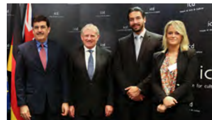
An Interview with the Hon. Simon Crean, Former Minister for Regional Australia, Regional Development & Local Government; Former Minister for the Arts

Mr Crean opened by outlining some of the success cultural diplomacy has had in his native Australia. Speaking of the “Chinese year of Culture” an Initiative of dance and cultural exchange that ran between Australia and China for two years from 2011, Mr Crean highlighted how in the two years the initiative was running, trade levels between China and Australia were at an all-time high, this, according to Mr Crean, was a testament to the economic impact Cultural Diplomacy can have. As defined by Mr Crean early in his lecture Cultural Diplomacy is to “help start conversations, share knowledge and convey nuanced messages”