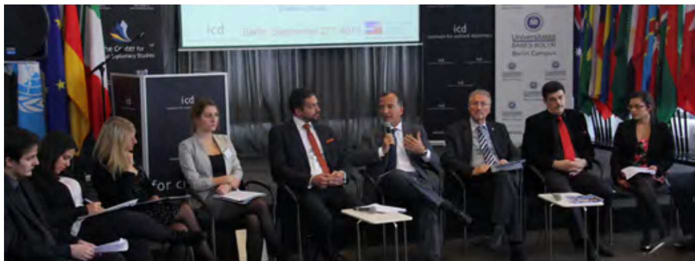
Panel Discussion during the Special Event “Young Leaders’ Contributions for Developing the Future of Cross Continental Cooperation”

In focusing on contemporary global issues, any long term and sustainable solutions require consideration of future generations. To this end the ICD established the Organization for Youth Education & Development (OYED) in cooperation with national governments as an organization dedicated to the initiation, promotion and execution of education and development programs for young generations.