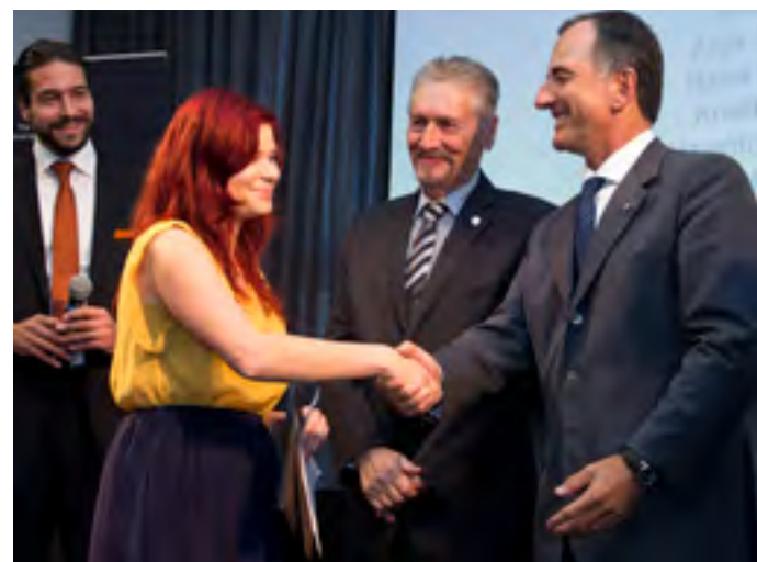
President of the OYED, Franco Frattini; and President of the Academy for Cultural Diplomacy, Dr. Emil Constantinescu, deliver the Awards to the ICD Interns