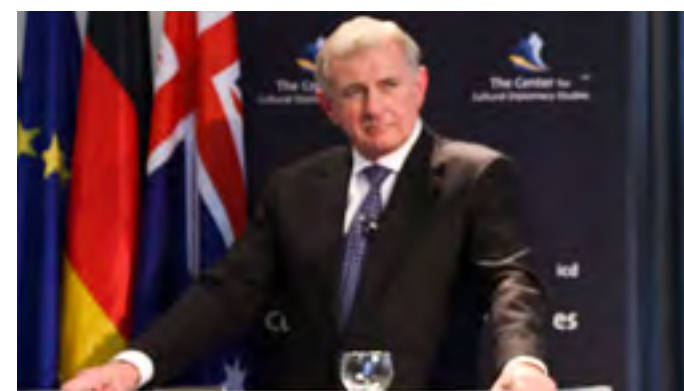
The Hon. Simon Crean, Former Minister for Regional Australia, Regional Development & Local Government; Former Minister for the Arts