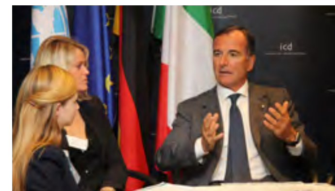
An Interview with President Franco Frattini, President of the OYED, Former Foreign Minister of Italy

The discussion culminated in the presentation of the OYED initiative “Bridging the Gap between Graduates and Employers”, an initiative comprised of a European Qualification Database via which all EU state labour and education ministries would be linked thus easing and improving the transition into employment. The discussion finished with a move away from the European perspective and touched on the need for more attention to be paid to less developed regions of the world. This highlighted the importance of Cultural Diplomacy encouraging people-to-people contact between cultures and countries which can help integrate those who feel excluded.