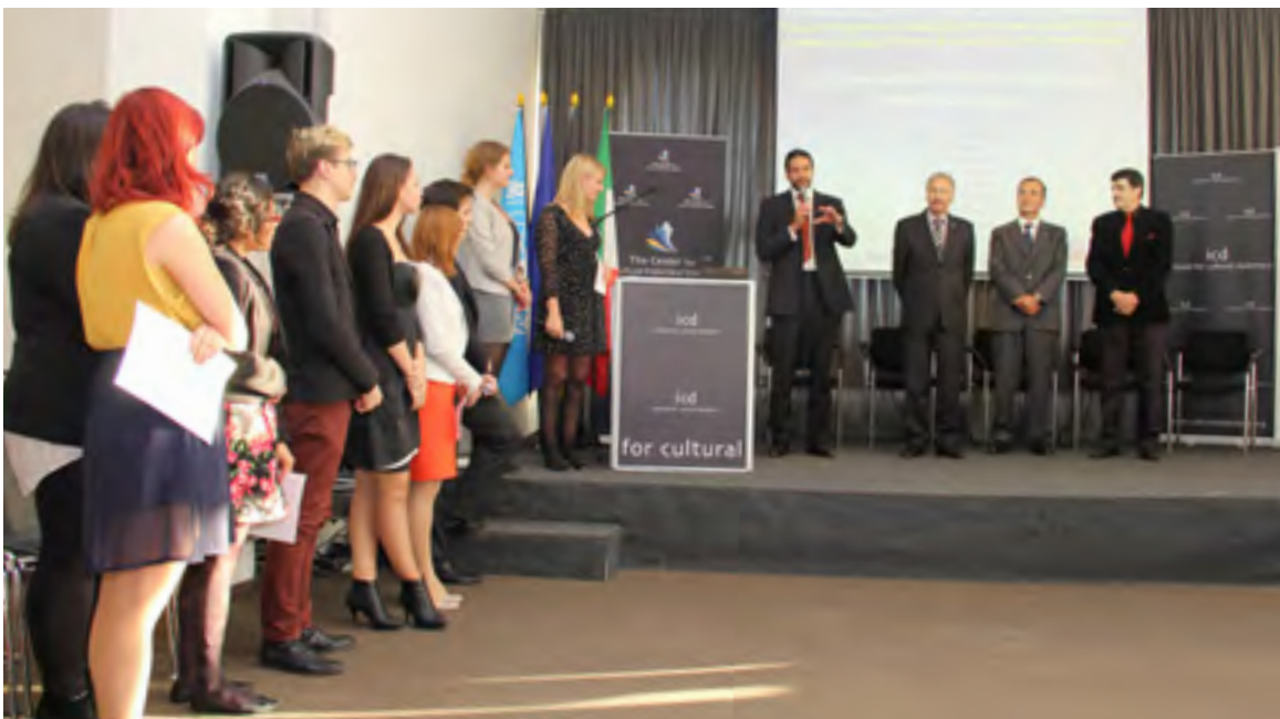
Interns Awards Ceremony (Berlin; September 27th, 2013)