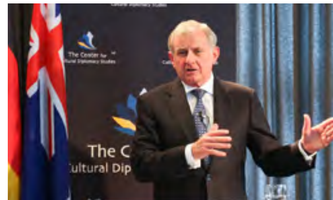
The Hon. Simon Crean Former Minister for Regional Australia, Regional Development & Local Government; Former Minister for the Arts;