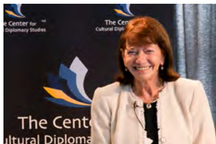
The Hon. Helga Daub Former Member of the German Parliament

“The Importance of Youth Education and Development Advancement and its Positive Influence on Strengthening the Relationships between Europe, Russia, China and the USA”.