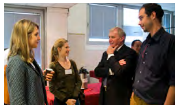
The Hon. Simon Crean meets with the participants of “The Berlin Inaugural Event of the Cross Continental Cooperation Summit”