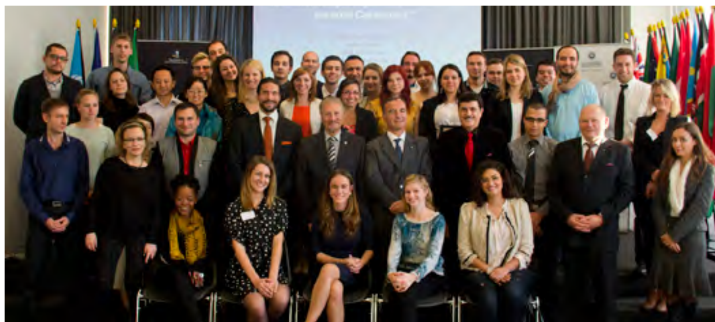
Group Photo with Speakers and Participants of “The Berlin Inaugural Event of the Cross Continental Cooperation Summit”

The Berlin Inaugural Event of the Cross Continental Cooperation Summit was officially opened on the morning of September 25th with a Welcome Address from Mark Donfried and the Hon. Dr. Nazar al Baharna, Director of the ICD Conflict Zone Mediation Center and former Foreign Minister of Bahrain.