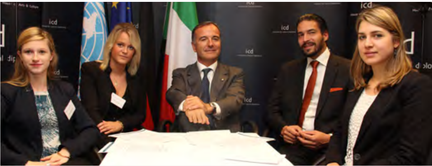
An Interview with President of the ICD Organization for Youth Education & Development, Franco Frattini (Berlin; September 27th, 2013)

The start of “The Cross Continental Cooperation Summit 2013” was marked with the Berlin Inaugural Event hosted from the 25th to the 27th of September. The Conference, the first of eight to be held globally as part of the Summit, gathered politicians, experts, and academics to contribute to the discussion “Future Prospects in International and Intercultural Relations: Building Bridges between Europe, USA, Russia and China”. The Conference provided a platform to explore the possibilities for the development of stronger relationships between Europe, Russia, China, and the USA. The main aim of this platform being to examine the potential advances in global stability, sustainable development, economy, and human rights that Cross Continental Cooperation can offer.