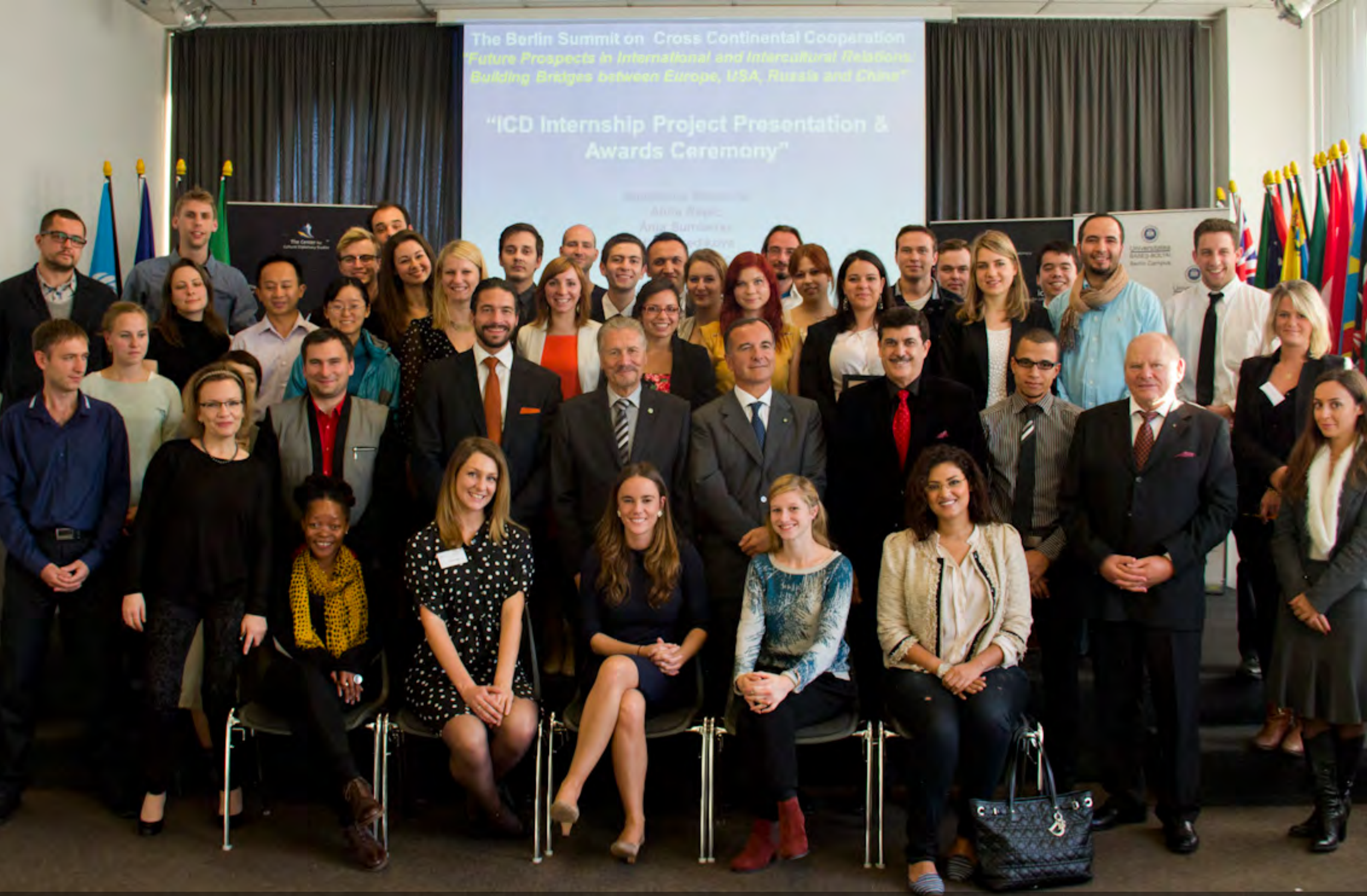
Group Photo with Speakers and Participants of "The Berlin Inaugural Event of the Cross Continental Cooperation Summit" (Berlin; September 27th, 2013)